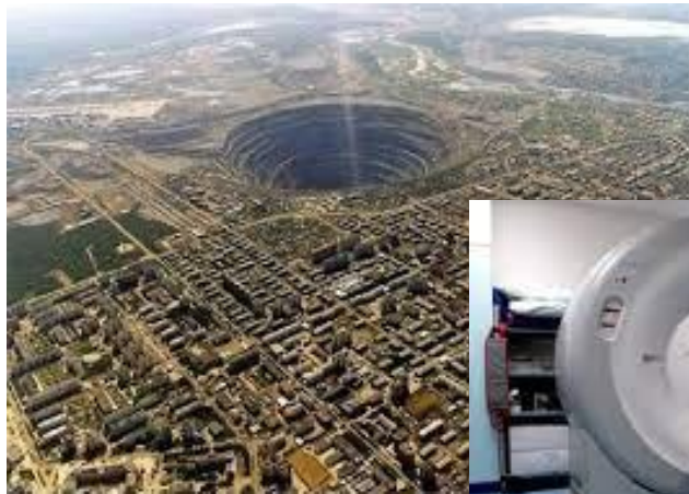
Critical spare parts for a mine in Siberia

“How do you make sure you have the right parts at the right time in a complex region like Russia & CIS?”