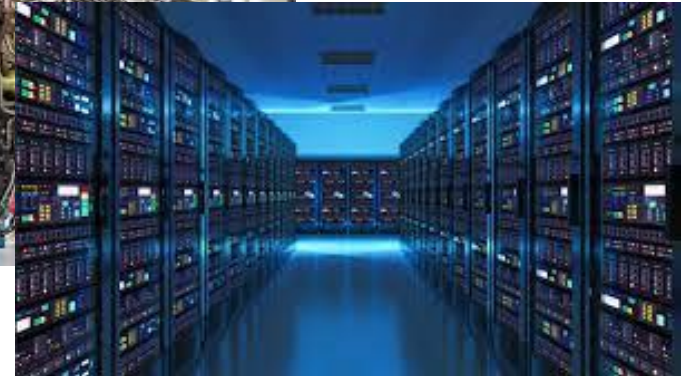
Data Center replacements