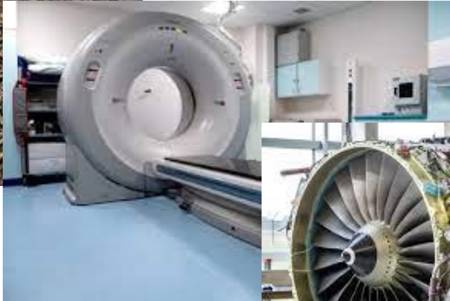
Important medical equipment