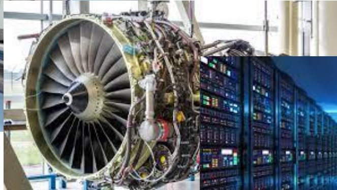
Regular local maintenance parts